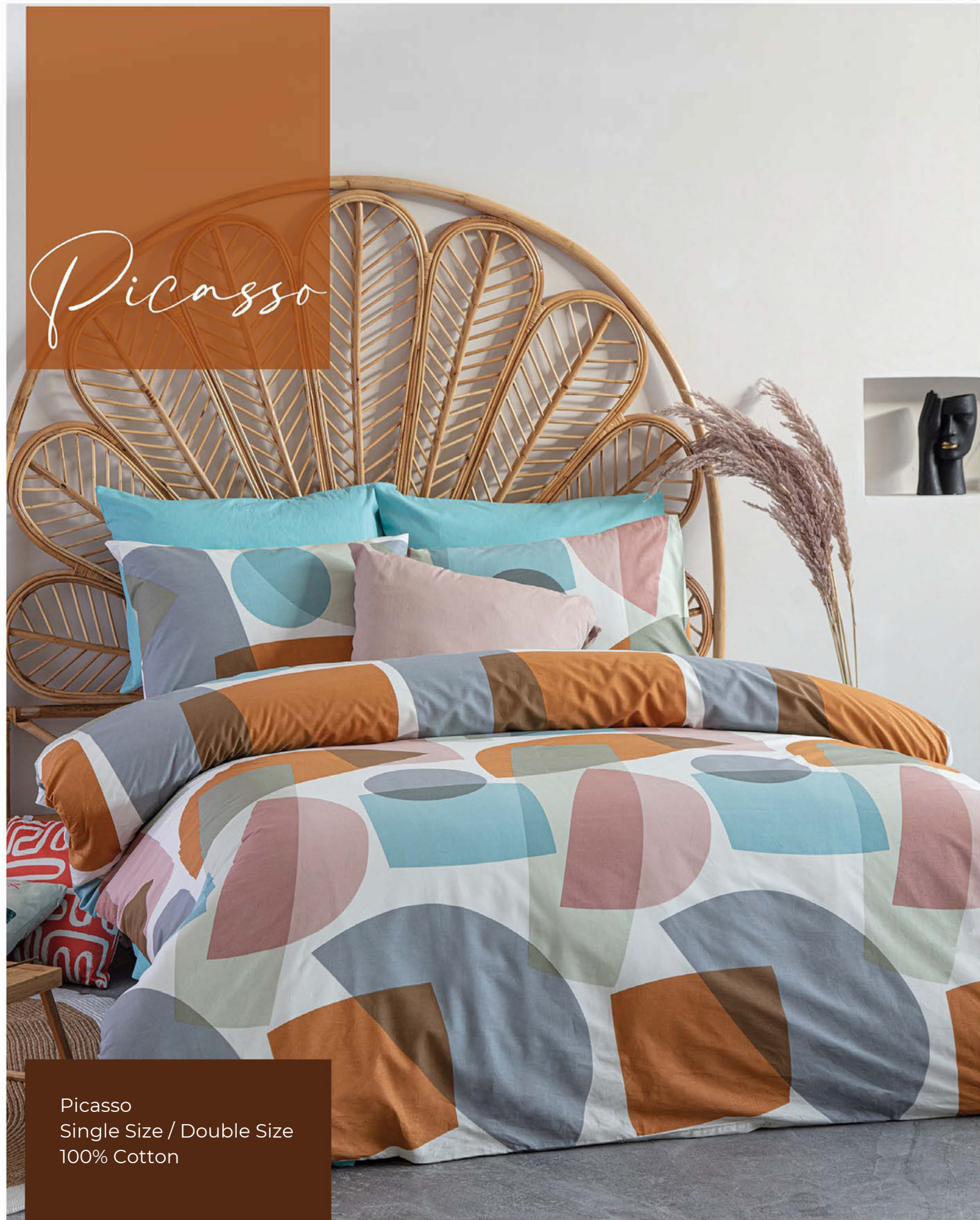
Picasso Single Size / Double Size 100% Cotton