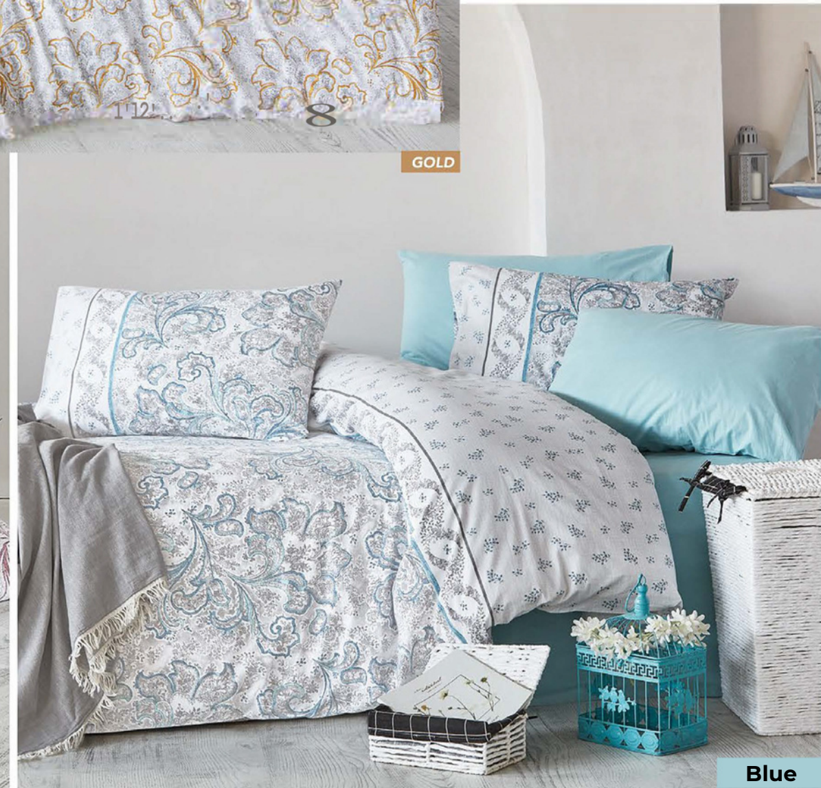
Miranda Single Size / Double Size 100% Cotton