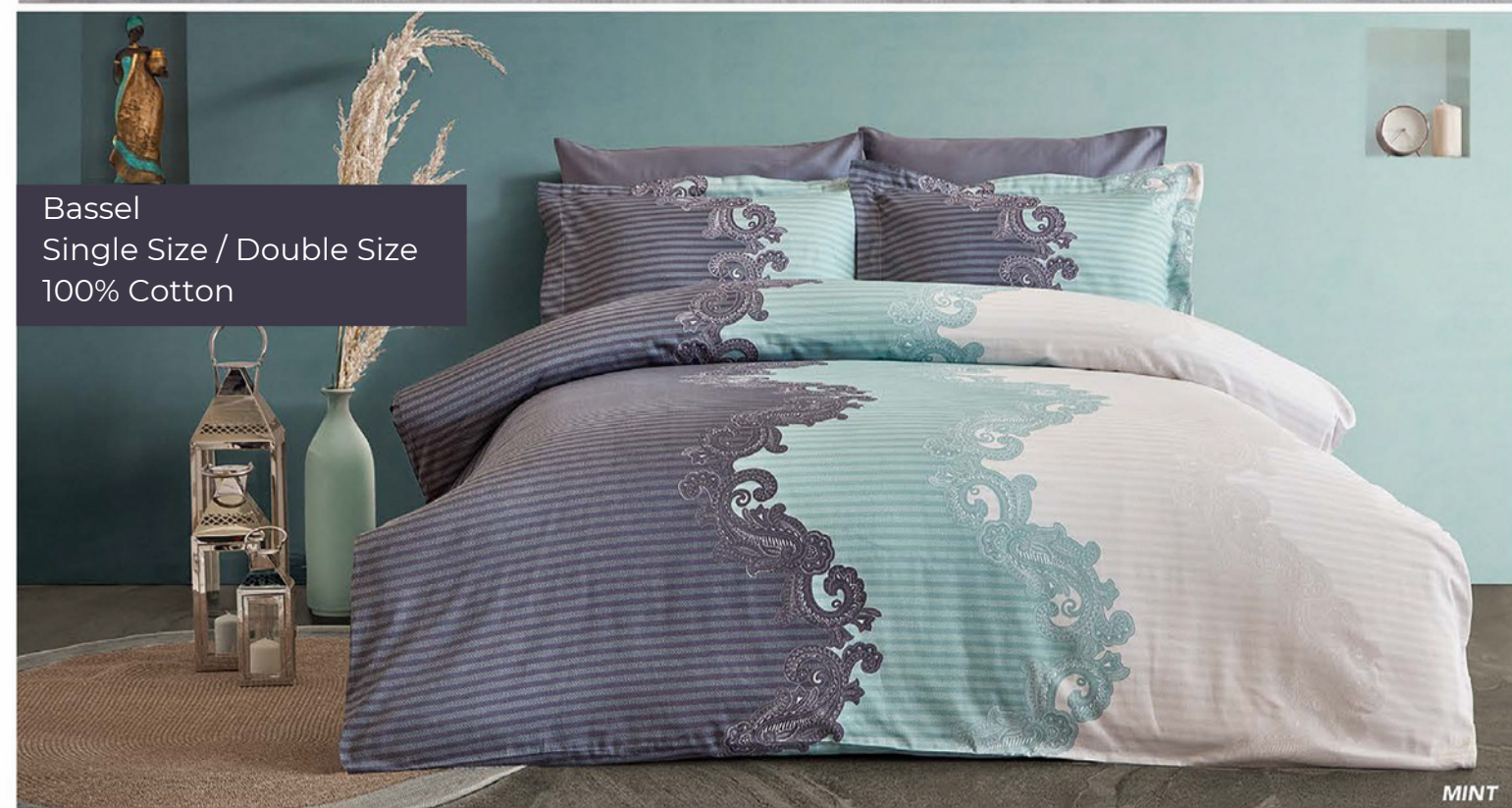
Bassel Single Size / Double Size 100% Cotton