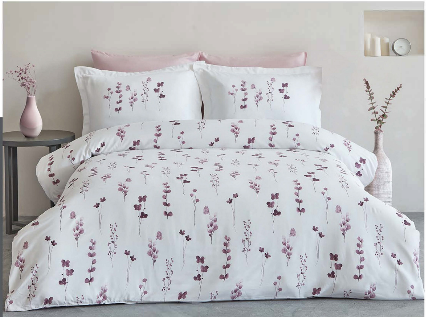
Kylie Single Size / Double Size 100% Cotton