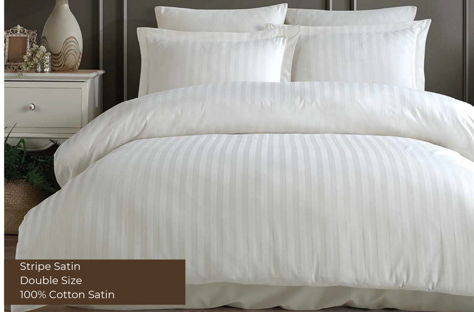
Stripe Satin Double Size 100% Cotton Satin