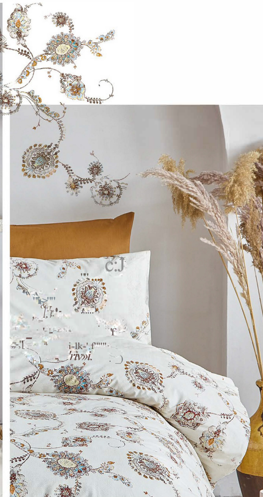
Alesta Single Size / Double Size 100% Cotton