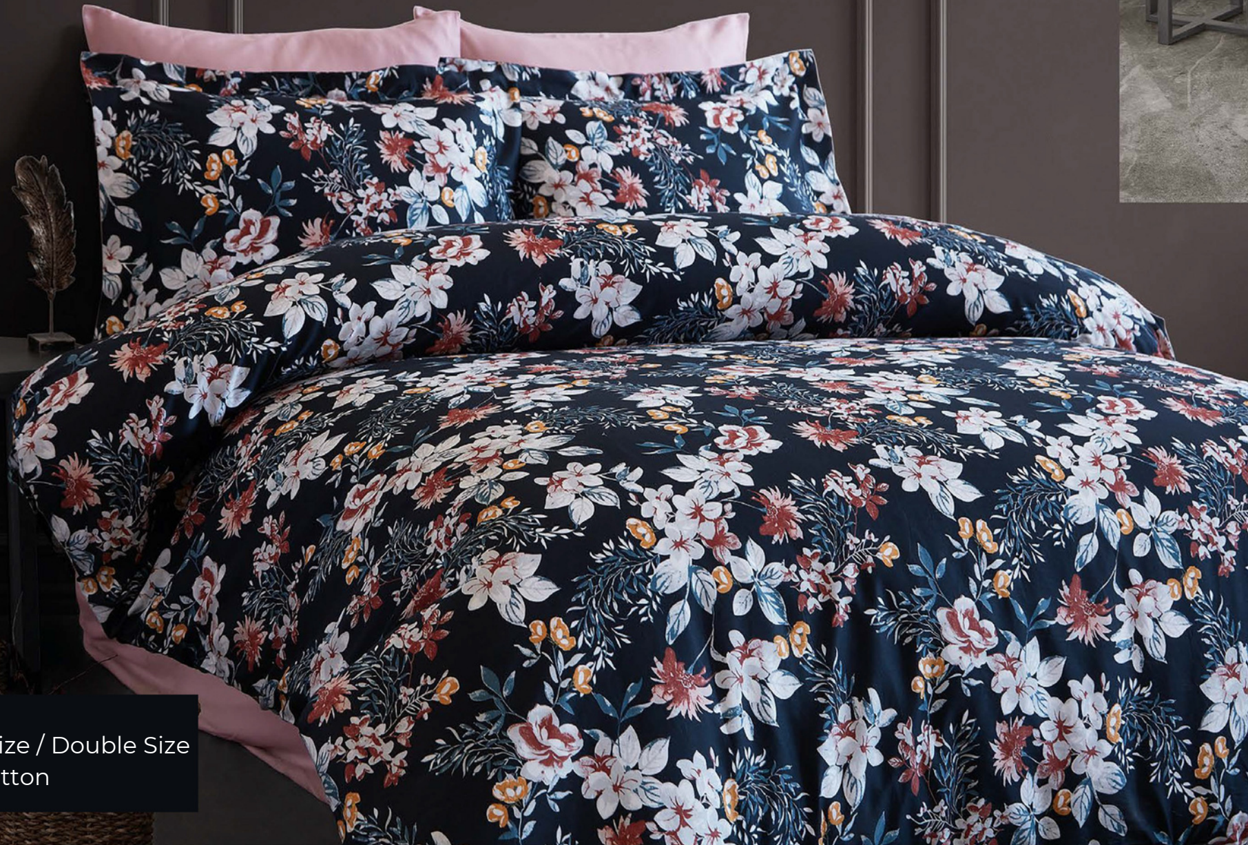
Eva Single Size / Double Size 100% Cotton