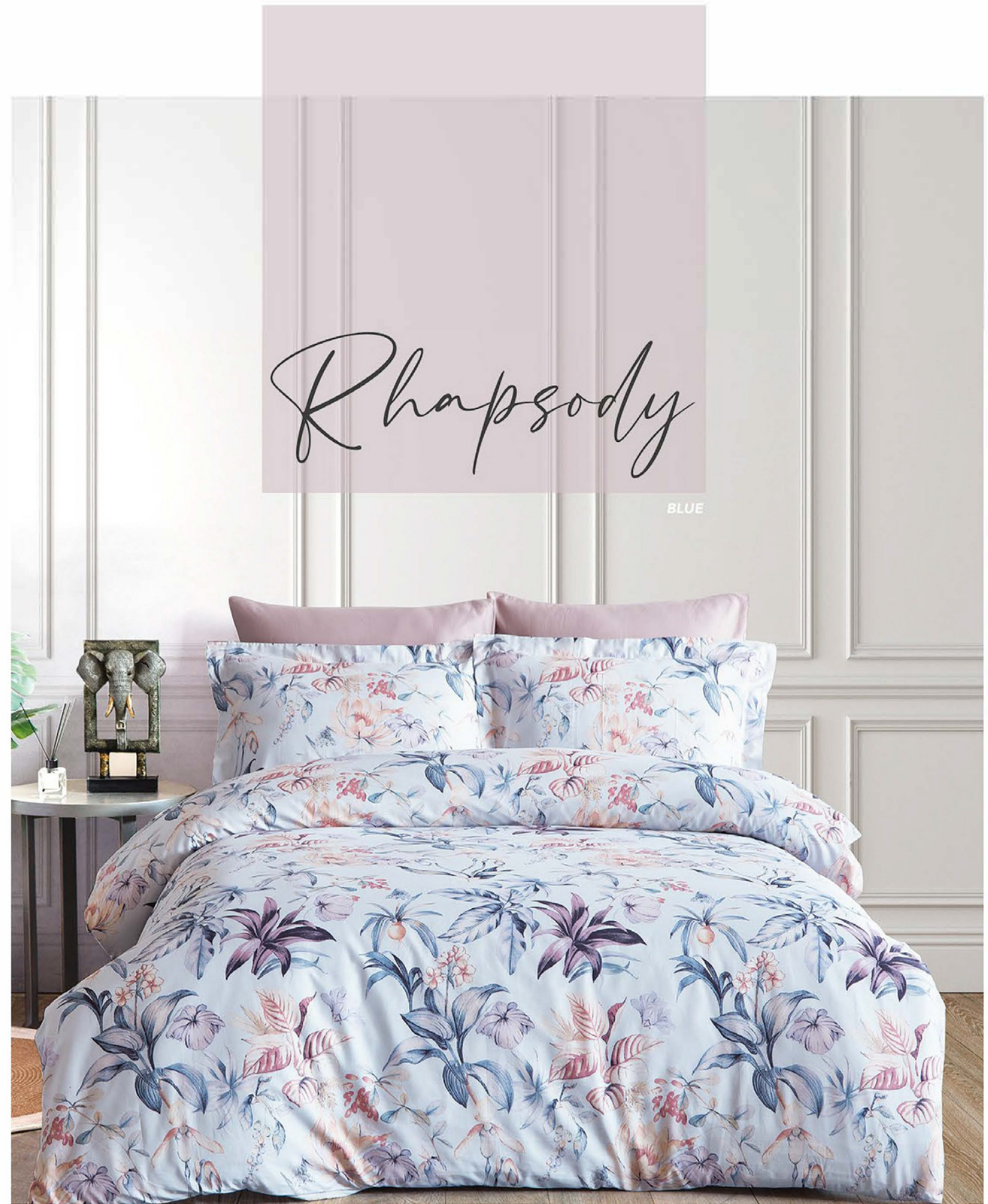
Rhapsody Single Size / Double Size 100% Cotton