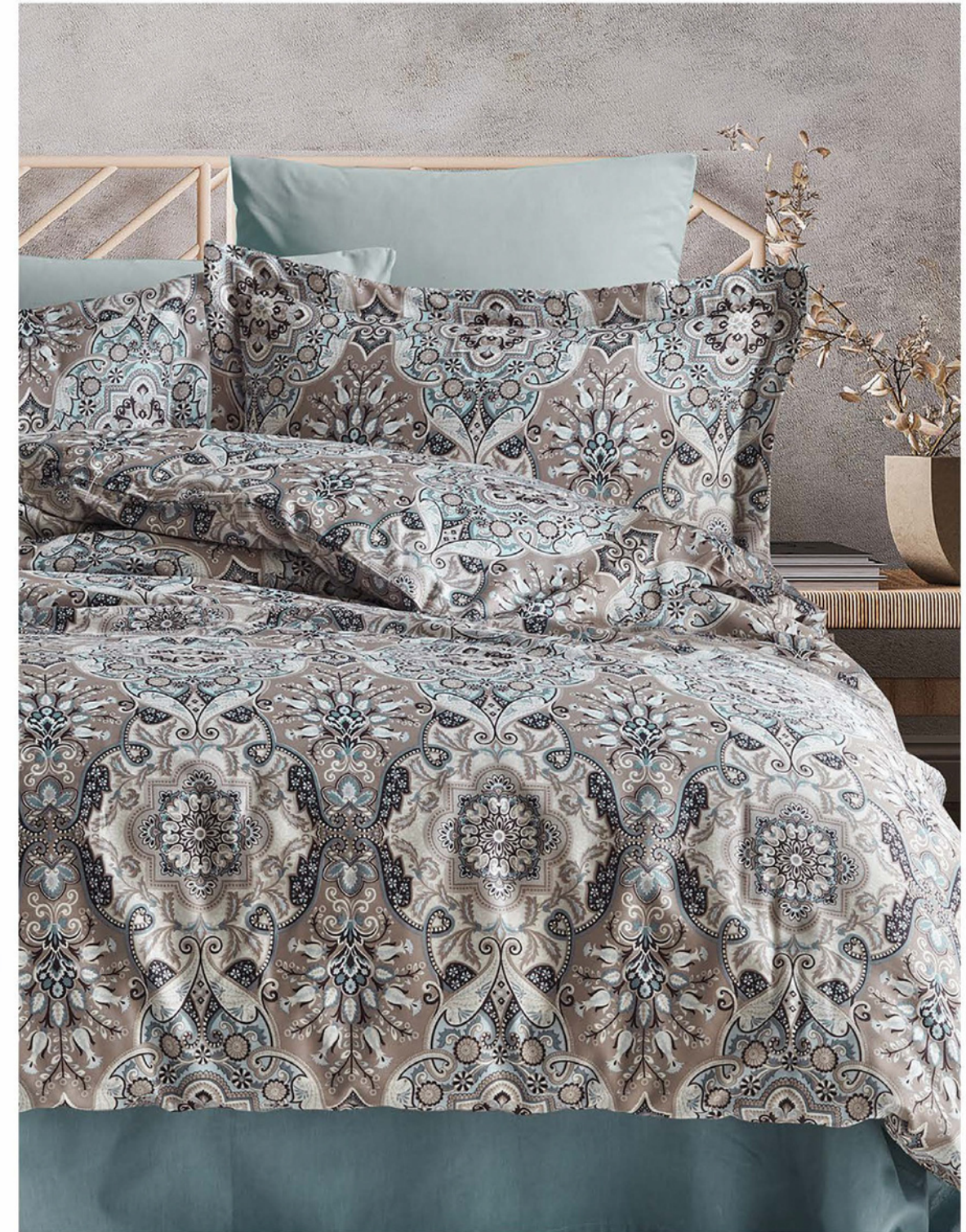
La Maison Single Size / Double Size 100% Cotton