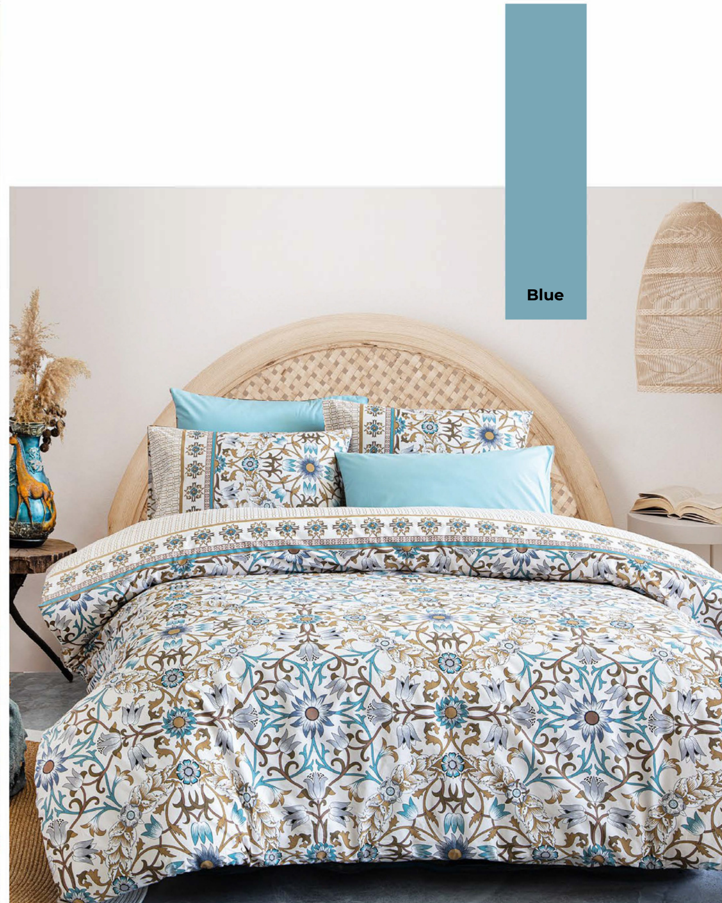
Efsun Single Size / Double Size 100% Cotton