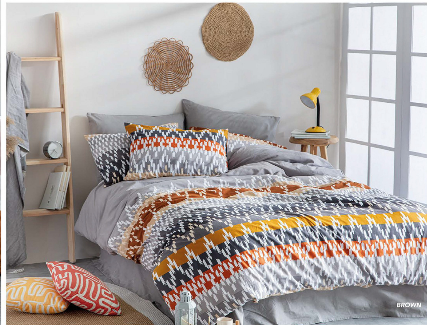
Lana Single Size / Double Size 100% Cotton