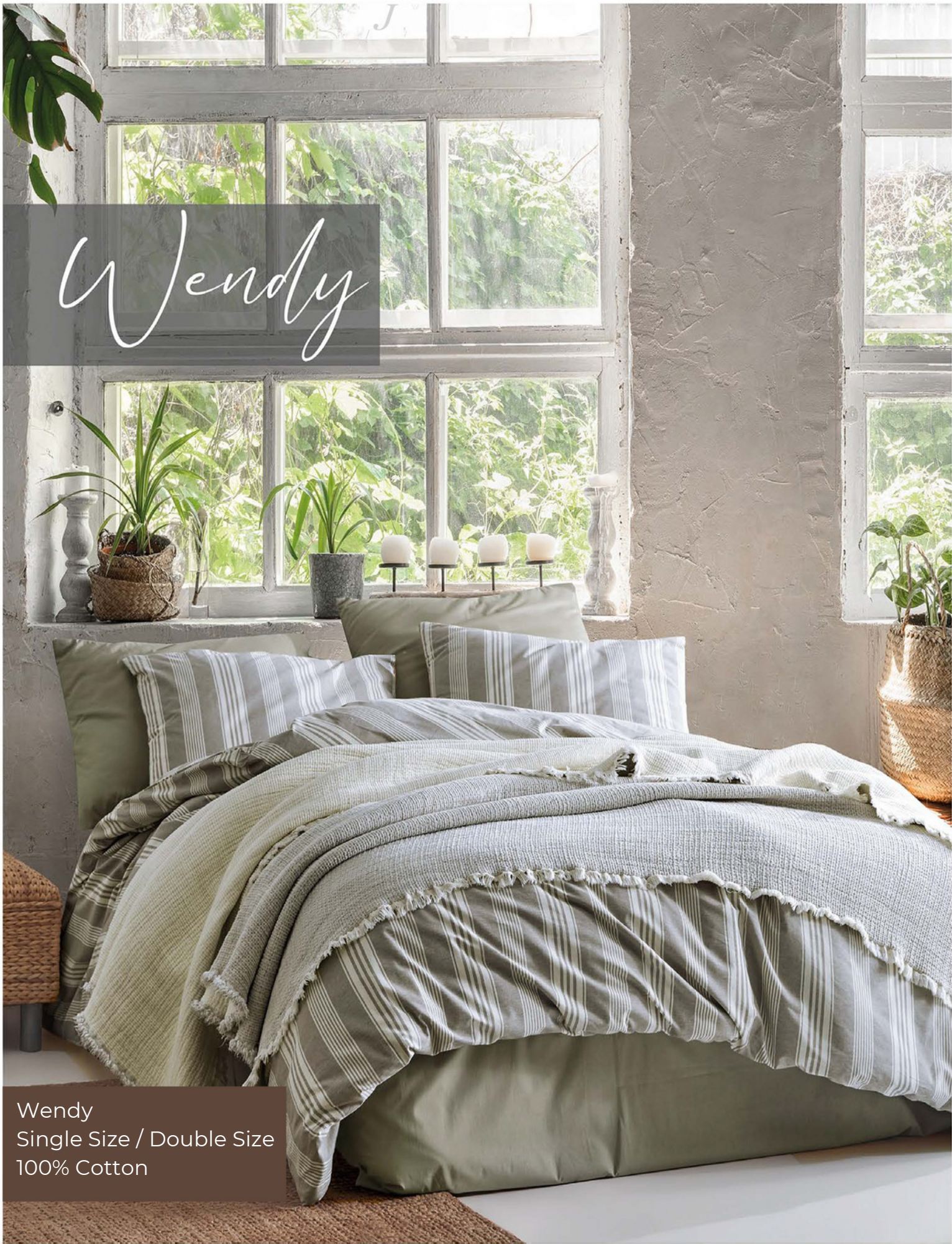
Wendy Single Size / Double Size 100% Cotton